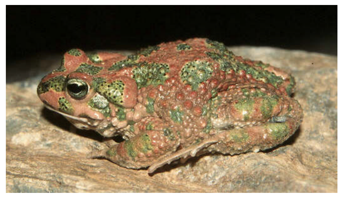
Adult 'red' female Bufo brongersmai.

the white animals do not have spots on the belly. Of course, both pattern and size differences can be caused by variability within this species, but it is possible that it is caused by the limited genetic diversity within the captive breeding population.