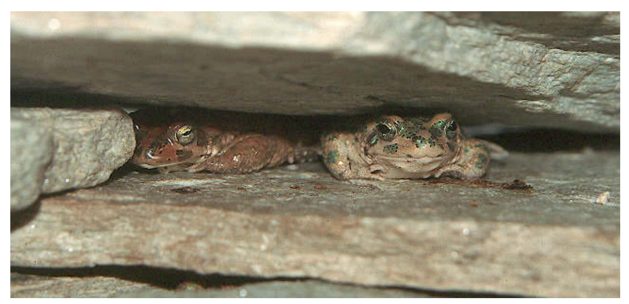
Two Bufo brongersmai basking between the rocks.

A small-sized Bufo , greyish brown with rather small green spots on its back. The interorbital space is always wider than the width of an upper eyelid. In adult specimens the head is more than twice as long as it is deep. The parotoids are small, slightly longer than wide, almost round.