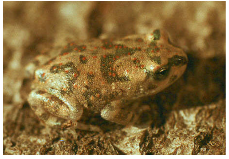
One week old Bufo brongersmai.