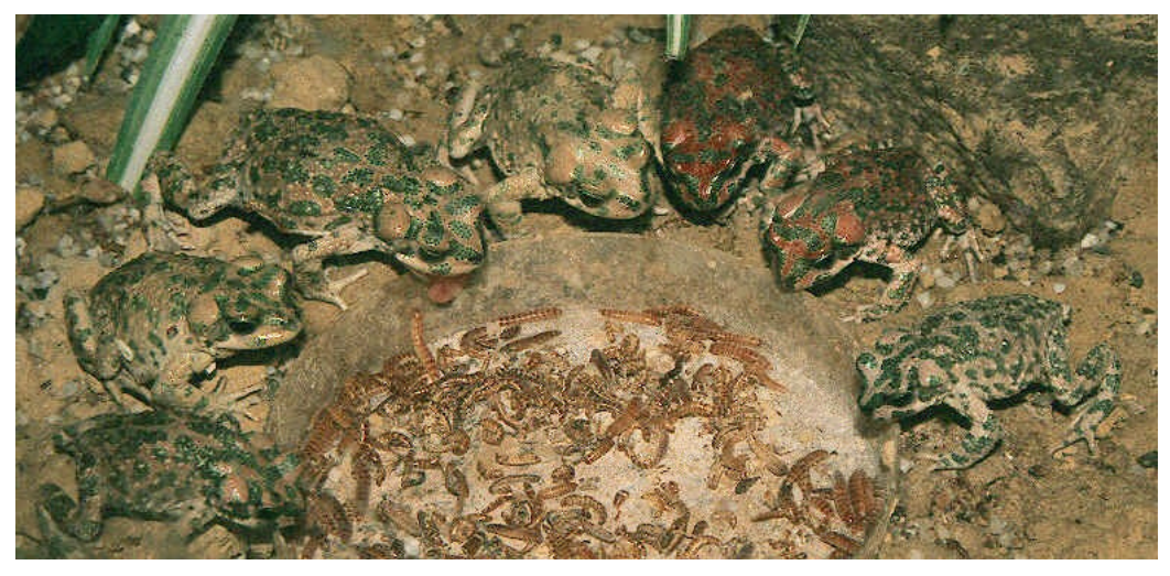
Young Bufo brongersmai at feeding time.

moist tissue and stacks of moist peat and bark. The animals were maintained at room temperature. They appeared to be very sensitive to humidity and the animals that were kept in drier conditions developed considerably better: faster and looked healthier. The amount of food that I needed to drag in became a big problem. I had severely underestimated this. The little toads ate tremendous amounts of food but grew very slowly at room temperature. At higher temperatures (created with the aid of a light) the toads developed much more quickly. Rob Veen kept his toads relatively warm and fed them every day. Under those conditions they may measure 13-14 mm after a week. The largest animals measured 20 mm already, only slightly over a month after metamorphosis (March 24)! Depending on their size, the juveniles are fed fruitflies and tiny crickets, but later on they also receive curly-winged flies and buffalo worms.