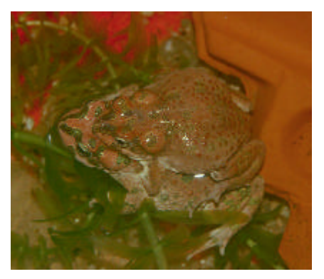
Amplexus of a 'red' pair of Bufo brongersmai.