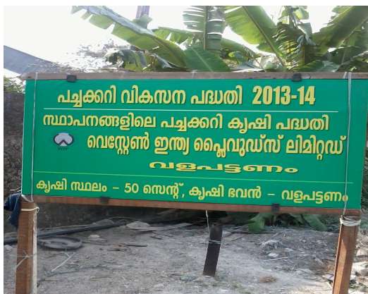
Fig.17: Field cultivation of vegetables using Vermicompost