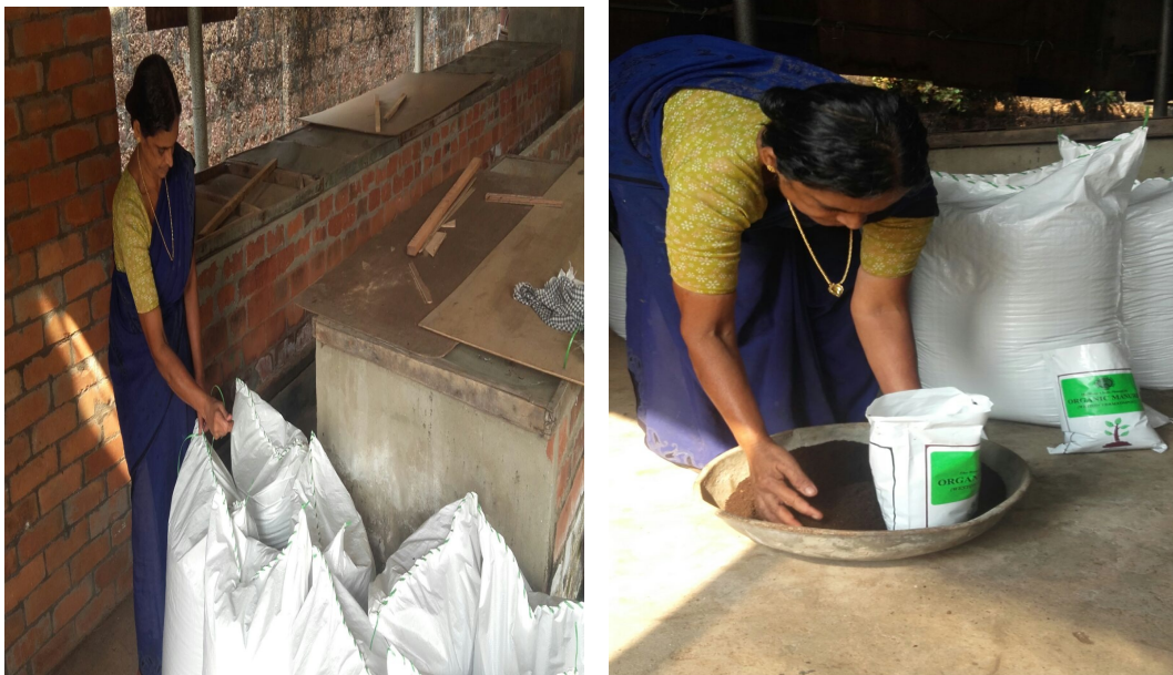
Fig.13: Vermicompost-Packing Operations and a Sample packet of 1Kg

The nutrient level of vermicompost depends on the nature of the organicwaste used as food source for earthworms. It is found that a heterogeneous waste mix will have balanced level of nutrients than from any one particular waste. It contributes to the supply of micronutrients essential for the crops. Apart from this, the stimulatory effect of vermicompost for nutrient uptake, growth and yield of crops is linked to the secretions of earthworms and the associated microbes mixed with the cast.