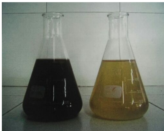
Fig.14 :Vermiwash-concentrated and diluted

Vermiwash has great growth promoting (Suthar,S.,2010) as well as pest killing properties. Study by Giraddi, R.S.(2003) reported that weekly application of vermiwash increased radish yield by 7.3%. Another study also reported that both growth and yield of paddy increased with the application of vermiwash and vermicast extracts (Thangavel, P et al , 2003)