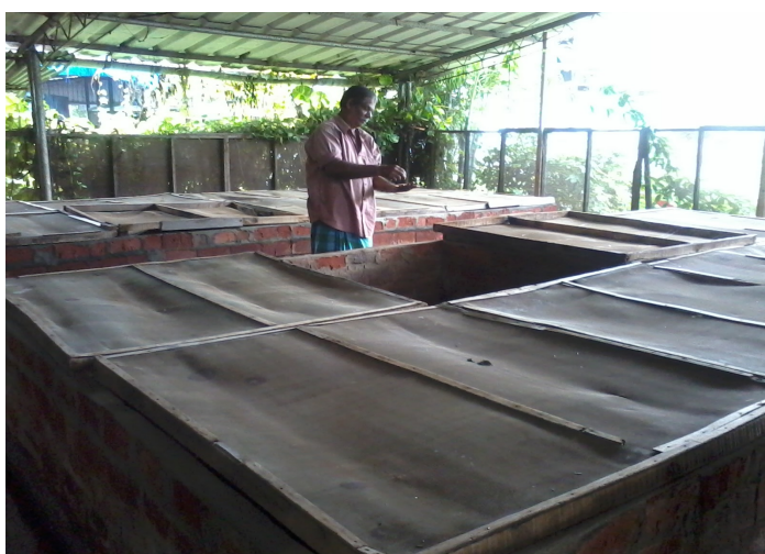
Fig.9: A view of a semi-commercial vermicomposting unit