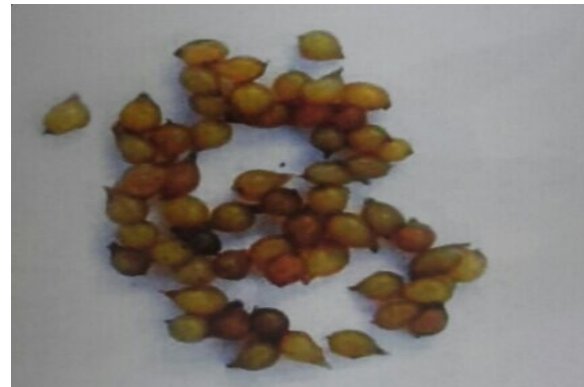
Fig.5: Earthworms: Cocoons

Calculating Rates: Epigeic worms reproduce very rapidly and the worm populations double every 60 to 90 days, if the following conditions are provided: