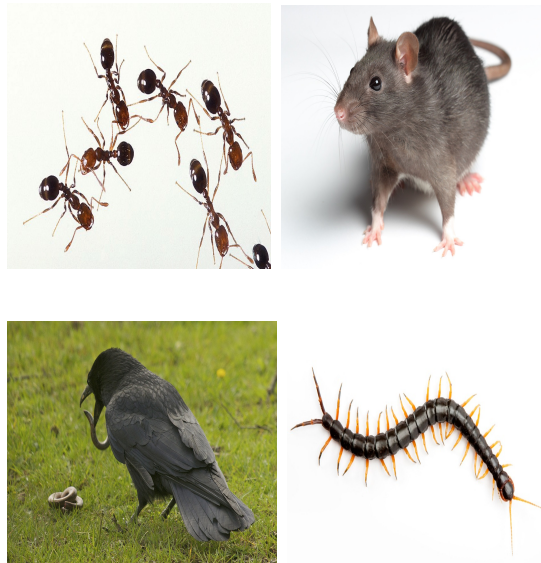
Fig.11: Common pests of vermibeds