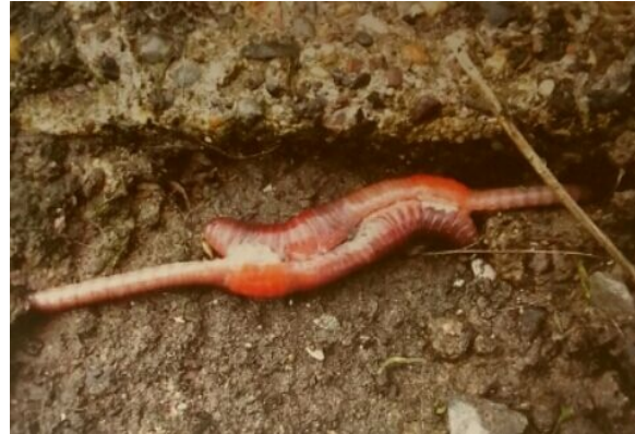
Fig. 4: Earthworms:Copulation

Red worms take 4 to 6 weeks to become sexually mature.