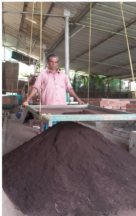
Fig.12: Screening and separation operation

Worm harvesting is usually carried out in order to sell the worms, rather