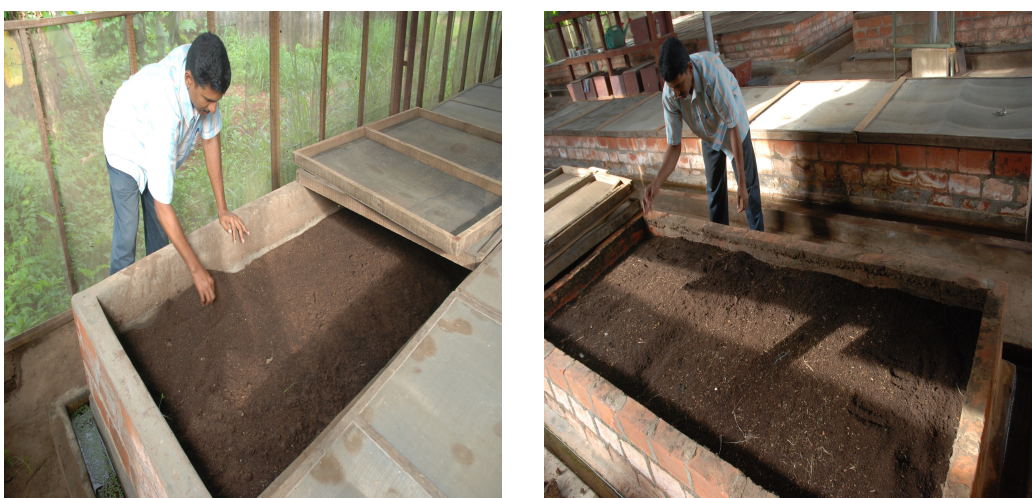
Fig.7: Vermicomposting tanks made of ordinary bricks in a semi-commercial unit

Vermicompost can also be prepared above the ground by using cement rings. The size of the cement ring should be 90 cm in diameter and 30 cm in height.