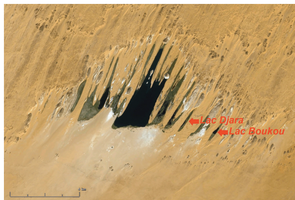
Fig. 2. Satellite view of Ounianga Serir lakes, with location of Lake Djara and Lake Boukou.

in Molomhar guelta in Mauritania, and seven species in Totous guelta in Tibesti in Chad (Daget 1959, Lévêque 1990, Monod 1951, Trape 2009).