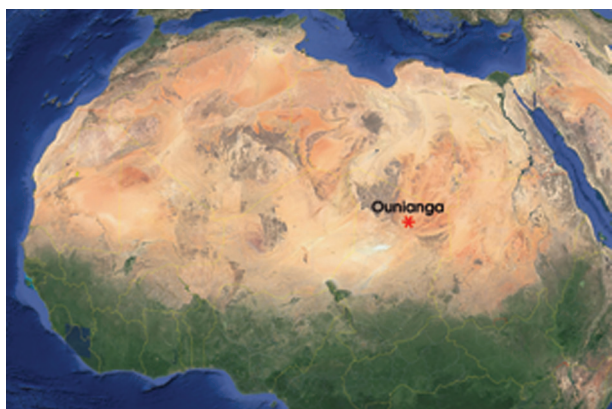
Fig. 1. Satellite view of the Sahara with location of Ounianga lakes (Chad).

Relict fish populations are known in several perennial bodies of waters of the Sahara desert, most of them located in mountainous massifs of central Sahara: the Adrar mountains in Mauritania, the Ahaggar, Tassili n'Ajjer and Mouydir in Algeria, and the Tibesti and Ennedi in Chad (Lévêque 1990, 2006; Trape 2009). Fish diversity is low, only two dozen of species have been recorded for the whole Sahara, and most species are known from a very low number of permanent water bodies, often from a single spring, guelta, pound or lake (Trape 2009). The number of species sharing the same water body usually ranges from one to three, with a maximum of four species