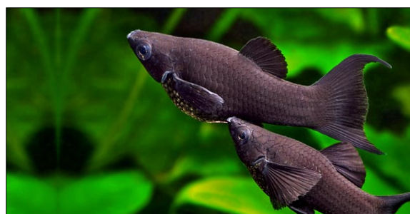
Fig 3: A pair of molly's breeding

Male Mollies are incredibly aggressive in their breeding habits, so as long as the tank is set up in a way that the Mollies feel comfortable, we expect some molly fry within a couple of months. The black molly fry will require plenty of plants to hide between, if you want them to survive. Mollies are not the most considerate parents in the aquarium, so they will eat any fry that they feast their eyes on. You can tell if the female Molly is pregnant by looking at their anal fin, which should show a dark gravid spot. If that fails, the obvious increase in plumpness should be a solid indicator that she is carrying some fry. The number of fry we can expect will depend on the age of the parent, but on average, you will see anywhere from 40 to 100 fry per birthing. The entire process from impregnation to birth will usually take between 6 to 8 weeks, but we have had cases where the gestation takes just 4 weeks. The baby fry don't require any special treatment after birth, and their diets are the same as their parents from the get go. A good quality flake which has been ground up, as well as some small brine shrimp, daphnia or microworms will definitely do the trick. When kept in water containing algae will help the fries to eat those algae and get a proper nutrition to them. To ensure full development, we recommend feeding your newly born fry at least 3 to 4 times per day.