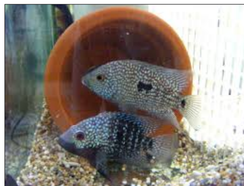
Fig 5: Breeding pair of Texas cichlid. Male with black bottom while female with normal colour.

known for its cream and turquoise spots. Adult males also develop a nuchal hump on their head. This cichlid also prefers the water temperature to be between 68 and 82 °F (20–28 °C) and is negatively affected by rapid changes in temperature. Herichthys cyanoguttatus are a large and aggressive fish that can reach up to a foot in length, although most sold in the aquarium trade attain an adult size that is a bit smaller than that. The body of this species is pearl-gray with blue to green hued scales that give the appearance of pearly iridescent speckles, giving it one of its common names of Pearl Cichlid. Mature males develop the traditional nuchal hump on the head, above the eyes. When spawning, the fish assumes a striking half and half coloration, with the front portion of the body becoming white, and the rear and underbelly being black, or black and grey barred.