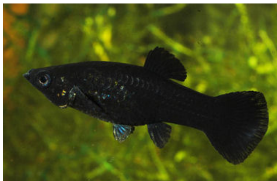
Fig 1: Female Molly