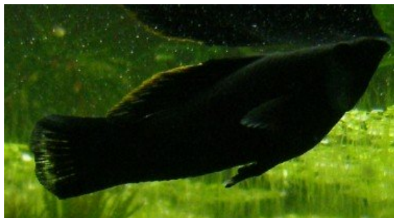
Fig 2: Male Molly