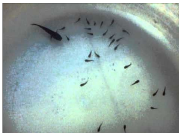
Fig 4: Female molly with fries

The baby fries require proper aeration after their birth. They are an easy prey for the other adult fishes including their own parents. The fries are to be immediately separated after the birth until they are mature enough. The fries feed on the algae and the mashed feed given to them as they are not capable to eat the large sized feed. The temperature of the tank where the fries are kept. Proper amount of food and feed helps the proper growth of the fries. The no. of fries starts from 5 and may increase to 50.