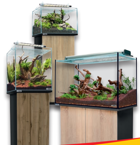
AquaTanks and Scaper Cubes Modern aquarium combinations from 48 to 160 liters (12.7 to 42 US gal.)

These popular Butterfly Cichlids are the 'Electric Blue' fancy variant. The animals cannot be found in this coloration in their natural South American habitat. These rather small cichlids grow to 7 cm (3 in.) at the maximum and are well suited for keeping them together with peaceful tetras. They are thus also ideally suited for smaller community aquariums above 80 cm (31 in.) with densely growing plants.