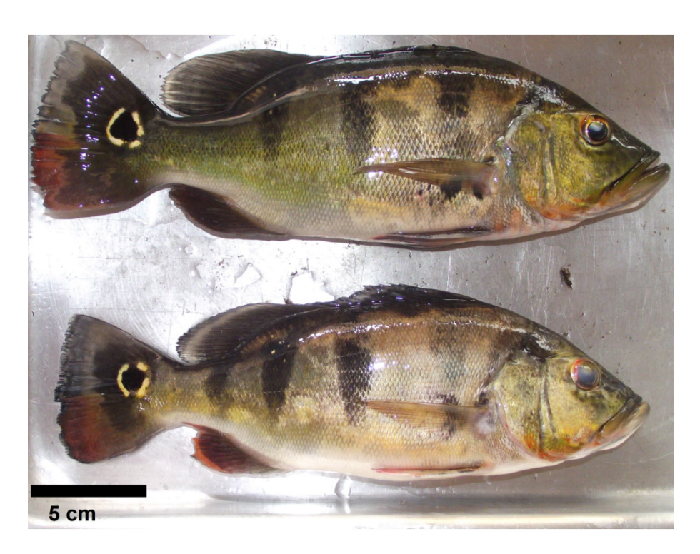
Figure 2. Specimens of Cichla kelberi sampled in an adjacent lake of the Caramujo stream, superior region of the upper Paraguay River basin, Pantanal (voucher ID: NUP 14756).