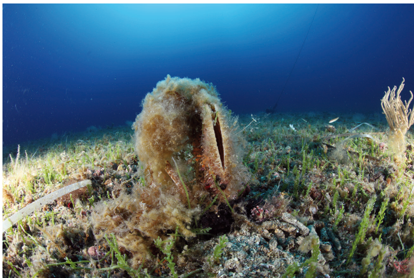
Figure 1. Living pen shell Pinna nobilis in the concerned area off the south coast of Port-Cros Island, August 2020.

pen shells were observed between 23 to 27 m depth distributed over an area of approximately 1 000 m 2 (Table I). In the same area, 42 dead pen shells were observed (Fig. 2). The bottom is constituted of detritic sediment together with bryozoans and shell debris and free-living calcified red algae (Corallinales). This community is characteristic of Mediterranean detritic soft sediment exposed to deep-sea current. The colonization by the invasive green alga Caulerpa cylindracea Sonder is extensive (Fig. 2).