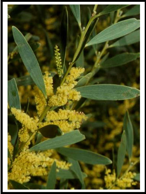
Acacia longifolia var. sophorae