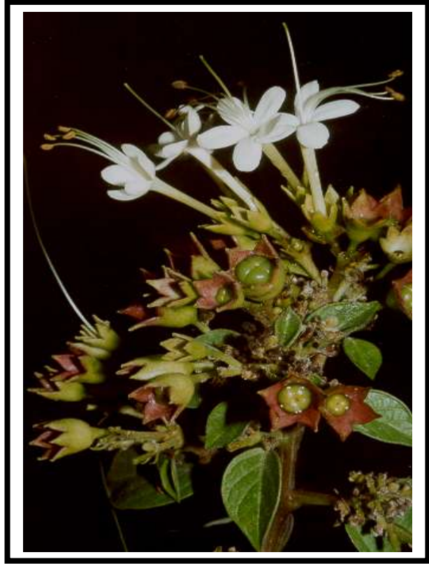
Callistemon pachyphyllus Clerodendrum floribundum