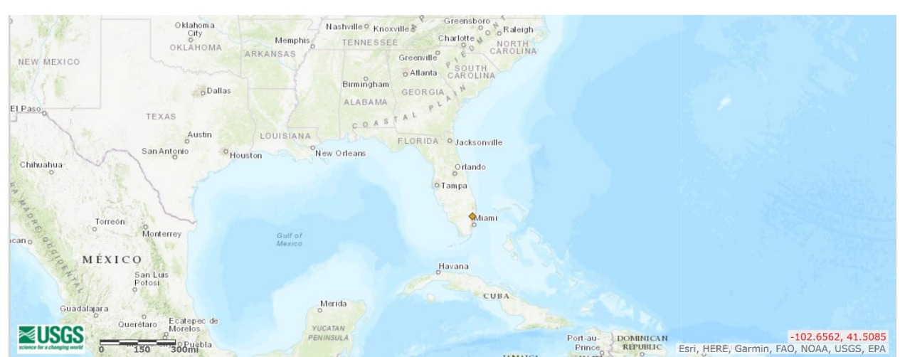
Figure 2 . Known distribution of Polypterus delhezi in the United States. Location is on the southern Atlantic coast of Florida. Map from Neilson and Fuller (2018). The location Florida was not used to select source points for the climate match. The introduction failed to establish a wild population.