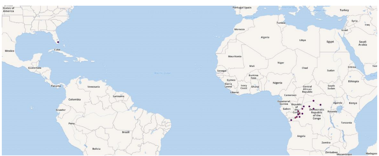
Figure 1 . Known global distribution of Polypterus delhezi . Locations are in the Republic of the Congo, Democratic Republic of the Congo, and Florida. Map from GBIF Secretariat (2018). The location in Florida was not used to select source points for the climate match. The introduction failed to establish a wild population (Neilson and Fuller 2018).

Polypterus delhezi is reported as present in Nigeria (Blessing 2013) and the Central African Republic (Froese and Pauly 2018) but no occurrence records from those countries were found.