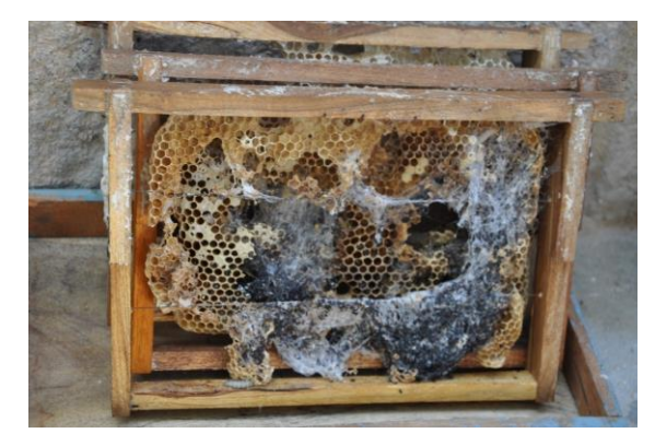
Plate 3: Damage caused by Galleria mellonella