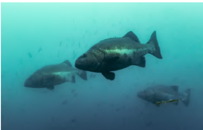
▲ An aggregation of giant groupers on Isla Natividad, Baja California Sur.

The first results of our research suggest that the population of this iconic fish is probably higher than previously reported, especially in Mexico. This work incorporates the historical analysis of the fishery, spatial analysis of contemporary fishing and preliminary results of biological monitoring, as well as an exhaustive review of the geographic distribution of the species. Some of the most important findings of this work include that the so-called giant sea bass fishery collapse recorded by the United States fleet was actually a change in fishing regulations between the two countries, and that the Mexican commercial fleet has caught an average of 50 tons per year in the last 50 years. In addition, we will soon publish the age and growth analysis using otoliths, and the size distribution, among other important features of the life history of this species, which together with the fishing statistics, will allow recommendations to be made to improve the management of this species. In addition, we will actively participate in updating the assessment for this species, and with the new information available, in addition to the new IUCN assessment protocols, we are optimistic about the possible outcome. But that will be part of the next story.