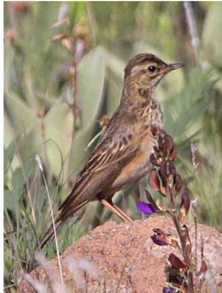
Dark (although young) African Pipit in Nyika

One of Nyika's most famous birding localities is Chowo Forest (in Zambia). We visited twice. Another almost as good forest is Zovo-Chipolo which we visited once. We also drove "Chelinda Valley circular route" and birded around the Chelinda dams.