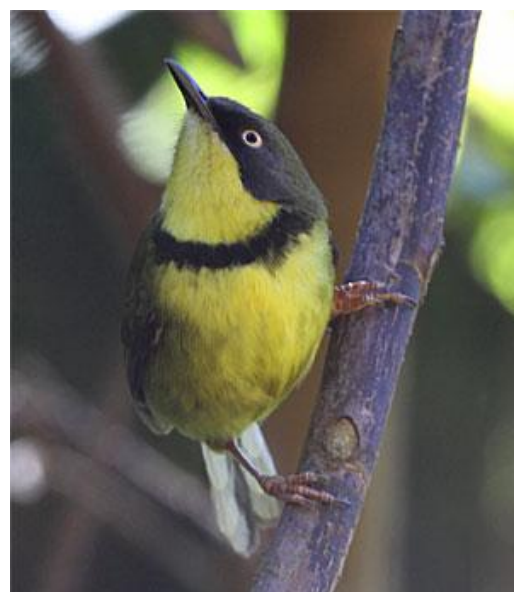
Bar-throated Apalis (Yellow-throated)

Birdwatching started in the early morning around the lodge (accompanied by Ronald's Great Dane/Lab mix Patch). We could have spent the whole day following the nice paths winding up and down the plateau, but we had some important species to go for in several other sites. We dropped off wife and kids at "Maggie's stable" for a nice mountain ride while Ben and I went in search of some Zomba specials. We did quite well, I think, in just a few hours we had nice views of several sought after species like Orange Ground-Thrush, Cholo Alethe, Bar-throated Apalis