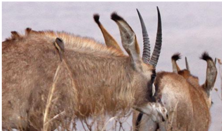
Roan Antelopes and Yellow-billed Oxpecker