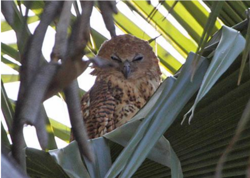
Sleepy Pel's Fishing-Owl

White-faced Whistling- and Comb Duck, Osprey, African Fish-Eagle, Brown Snake-Eagle, African Harrier-Hawk, Red-necked Falcon, Dickinson's Kestrel, Long-toed lapwing, Spur-winged Plover, Brown-necked Parrot (Grey-headed), Giant-, Pied-, Malachite-, Brown-hooded- and Striped Kingfisher, Broad-billed Roller, Southern Red-billed-, African Gray- and Trumpeter Hornbill,