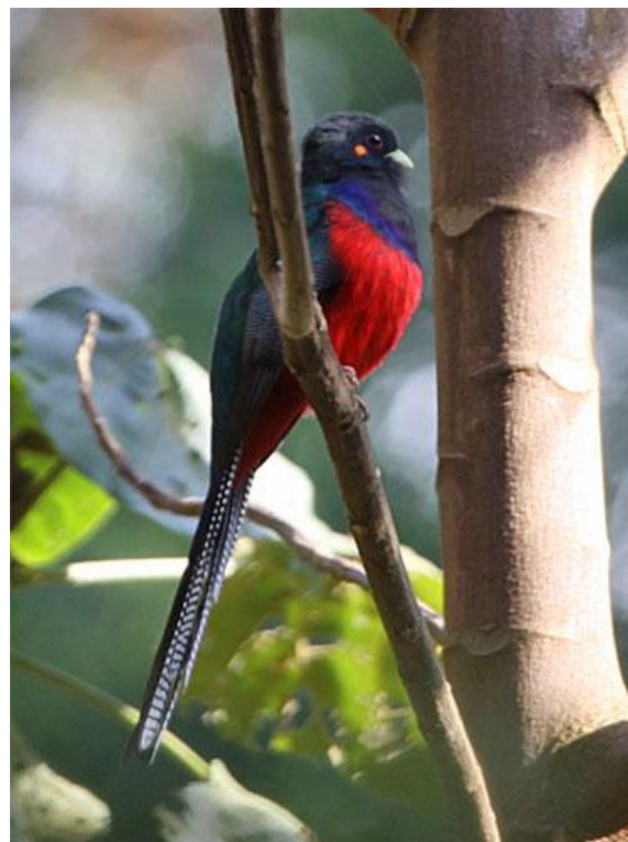
Bar-tailed Trogon in Chowo Forest

More nice Nyika bird species were: Crowned Hawk-Eagle , Red-winged Francolin , Temminck's Courser , Dusky Turtle-Dove , Scarce Swift , Moustached Tinkerbird , African Hill Babbler , Olive-flanked Robin-Chat , White-starred Robin , Cinnamon Bracken-Warbler , Black-lored Cisticola , Churring Cisticola , Wing-snapping Cisticola , Bar-throated Apalis ( youngi race), Chapin's Apalis , Brown-headed Apalis , White-tailed Crested Flycatcher (White-tailed Elminia), Cape Batis (Malawi), Slender-billed Starling , Waller's Starling , Yellow-billed Oxpecker , Montane Double-collared Sunbird (Ludwig's Double-collared), Baglafaecht Weaver and Buff-shouldered Widowbird (Montane).