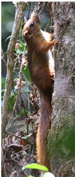
Tanganyikan Mountain Squirrel

In Chelinda we stayed in a very nice chalet managed by Dominique, a very nice elderly man who had worked here for many years. Dominique got the fire burning when we arrived, it felt a bit strange at first being in the middle of Africa, but it actually gets quite chilly in the evenings and nighttime at this altitude (2 300 m).