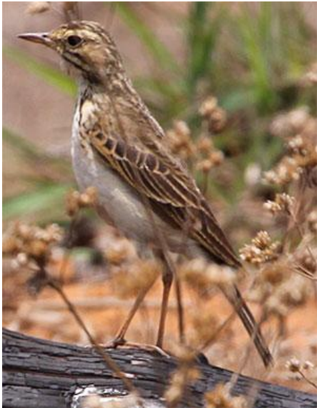
"Normal" African Pipit in Nyika