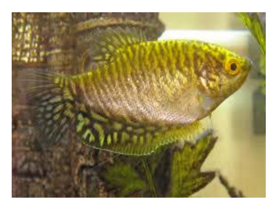
Fig. 2. Three spot gourami, Trichopodus trichopterus (brown form). [http://marinelifeinfo.blogspot.com/2012/07/three-spot-gourami.html, downloaded 1 April 2015]