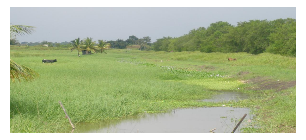
Fig. 3. An example of blue gourami habitat; the Oropouche stream.

For educational use only - copyright of images remains with original source