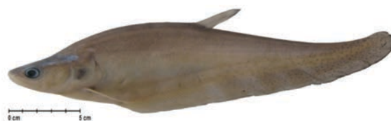
Figure 2. Giant featherback ( Chitala lopis )

The giant featherback usually inhabits the lowland river mainstems and tributaries with rocky and sunken wood bottoms and forest-covered streams. The timbers and logs are refuge areas for small fishes, shrimps, and aquatic insects which are the food source for the giant featherback mostly at night. Besides, the woods or logs serve as substrates for laying their fertilized eggs. During the dry season, they live in the river; and as the water level decreases, they swim to swamps and rice fields for spawning and feeding during the rainy season (Makmur et al. , 2008).