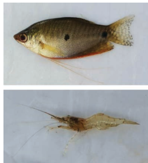
Figure 5. Snakeskin gourami (top) and small shrimp (bottom) as feed for the giant featherback

Currently, the domestication process is being carried out to enable the fish to adjust to its new habitat as well as the basic information on the suitability of the habitat and performance of the fish in aquaculture or conservation efforts is being obtained. During the culture trials, the broodstock of giant featherback was fed with snakeskin gourami ( Trichopodus pectoralis ) and small shrimps (Figure 5), while the juveniles were fed with artemia, Tubifex, shrimps, and vitamin E. The juveniles were placed in the aquarium with a cylindrical shelter arranged like a pyramid to protect the pups of the seeds as they grow.