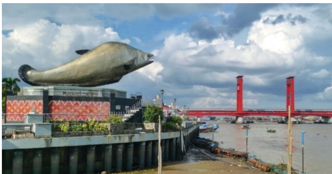
Figure 4. Giant featherback monument in the Kuto Besak Fort Plaza of Palembang City pointing to the Musi River