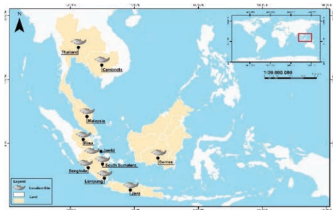
Figure 1. Distribution of giant featherback in Southeast Asia

Focusing on Chitala lopis or giant featherback, this fish species is found in the Mekong Basin and several Southeast Asian countries, particularly Cambodia, Indonesia, Malaysia, and Thailand (Kottelat et al. , 1993) (Figure 1). It is called “trekrai” or “trekrai” in Cambodia, “ikan belida” in Perak, Malaysia, or “pla satu” in Thailand. In Indonesia, this fish is distributed in Riau, Jambi, South Sumatra, Bengkulu,