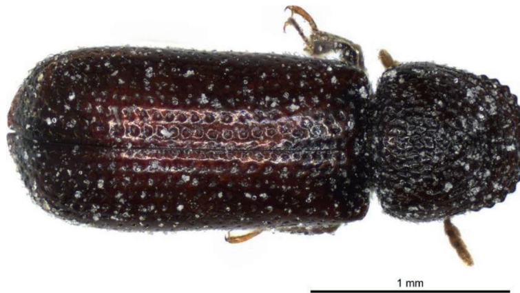
Figure 4. Dorsal view of adult of Rhyzopertha dominica .

Host range: Initially, it was mainly found to invest wheat packings but now it's found to be a pest of all cereals. It's mainly found in warmer areas of the world and damages mainly wheat, barley maize, paddy, sorghum, and other crops. It causes its damage by mainly boring into the wood in both larval and adult stages.