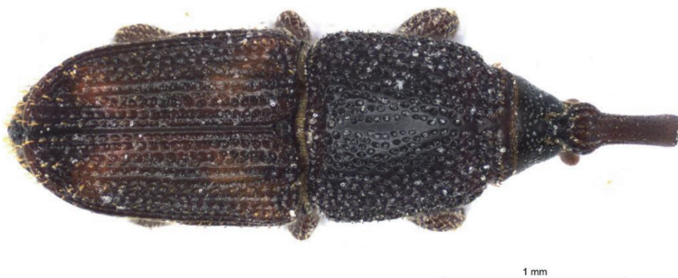
Figure 3. Dorsal view of adult of Sitophilus oryzae.

Distribution: Being cosmopolitan in nature, it is found all around the world.