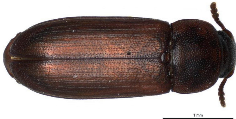
Figure 9. Dorsal view of adult of Tribolium castaneum .

Damage symptoms: Milled products are fed by both grubs and adults as well. Occurs as secondary infestation in stored sorghum, wheat, etc.