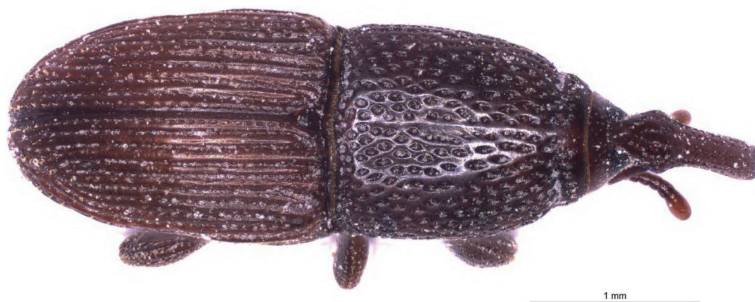
Figure 1. Dorsal view of adult of Sitophilus granarius .

Bionomics: Rice weevil or Black weevils are small snout beetles, dark brown having 4 distinct patches on the elytra, and prominent spots on the thorax and abdomen. Adults are similar to granary weevils but differ in color, markings, presence of wings beneath wing covers, and thorax with densely pitted with round