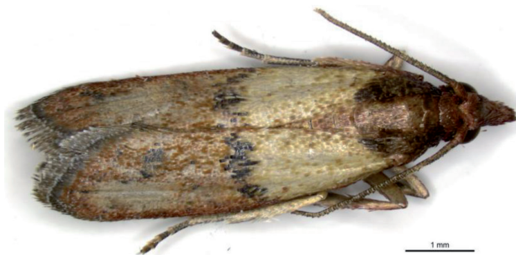
Figure 5. Dorsal view of adult of Plodia interpunctella .

Distribution: Being cosmopolitan in nature, the Mediterranean flour moth ( Lepidoptera : Pyralidae ) is found all around the world especially in countries