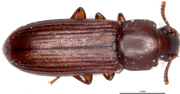
Figure 8. Dorsal view of adult of Tribolium confusum .

Damage symptoms: Being secondary pests they do not directly attack the grain bur when the grain is already infested, they show their effect. These pests generally give an unpleasant odor and also due to their presence, the growth of mold is encouraged.