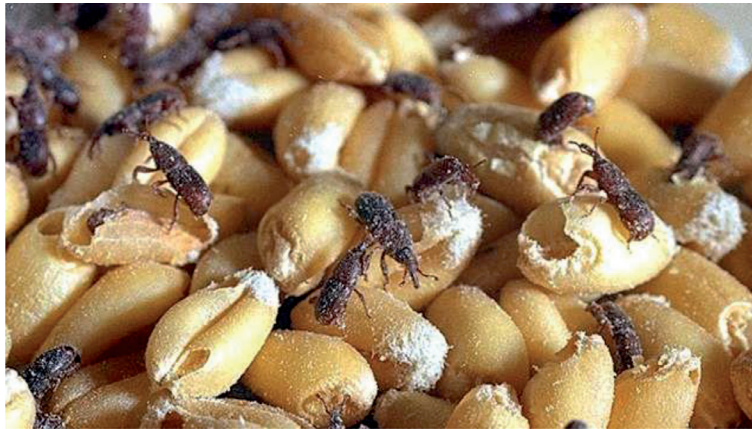
Figure 2. Damage status of Sitophilus granarius on wheat.

punctures ( Figure 3 ). Adults are tiny about 2.5 mm long and dark brown in color. Mostly both sexes are alike but in male's rostrum is short and broader. Females lay about 300–400 eggs. Adults are strong fliers and fly from granaries to granaries and to the grain fields for direct infestation. During summer life cycle is very short as compared to winter. Under hot and humid weather eggs take 4–5 days to hatch but under cold conditions eggs take 6–9 days to hatch. The newly hatched larvae bore into the kernel of the grain. Grubs are white in color, curved with a yellow or brown head's and hitting jaws. As grubs emerge from eggs they start feeding on the starchy material of the seeds, till it becomes fully grown and leaves behind only intact pericarp shell which is filled with grass. The grub stage mainly lasts for 19–34 days and then pupates to a non-feeding pupal stage after passing away prepupa for 2–3 days. The pupal stage mainly lasts for almost 1 week and after that adult emerges out of it and starts breeding. This pest completes its life cycle within a month. Most of the severely damaged crops resemble moldy grains.