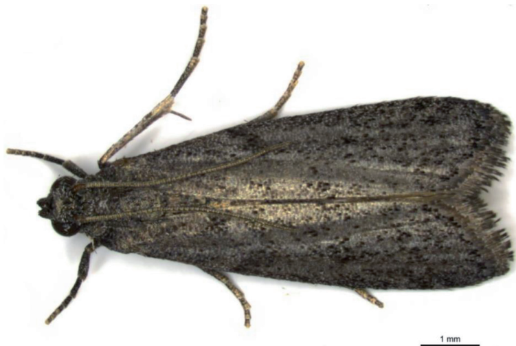
Figure 6. Dorsal view of adult of Ephestia kuehniella .

Bionomics: The meal snout moth is brown, larger than the Indian meal moth with patterned fore wings. Larvae which are black and white when fully grown, usually feed on cereals of all kinds and spin their resting place of peculiar tubes made up of silk and food particles. Fully-grown larvae come out from these tubes, spin silk cocoons, and transform into pupae. During favorable conditions, pupae are transformed into adult moths to start the new generation.