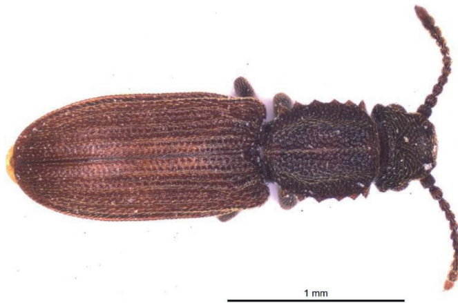
Figure 7. Dorsal view of adult of Oryzaephilus surinamensis .

Host range: Being a stored grain pest it generally attacks the stored products such as cereals, grains, etc.