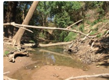
Bamboo Creek, near its junction with the Daly River.