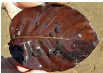
Neripteron transvesecostatum on leaf from Bamboo Creek. Note the white egg capsules on the shells.