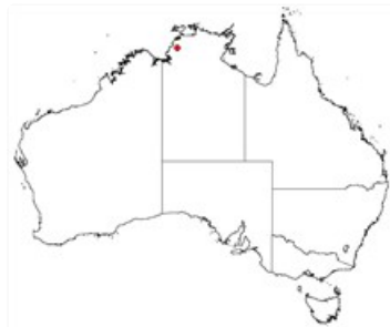
Distribution of Neripteron transvesecostatum