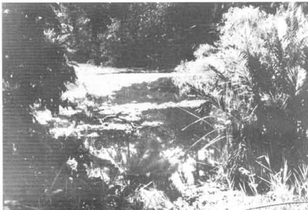
Figure 4. Top: pond 50 m south of Río Purificación, 4.0 km west of Mex. Hwy 200, Jalisco (Site 2); bottom: type locality of Kinosternon chimalhuaca , 1.9 km northeast of Barra de Navidad, Jalisco (Site 1).

by Europeans (see Willey et al., 1964, and West and Augelli, 1976).