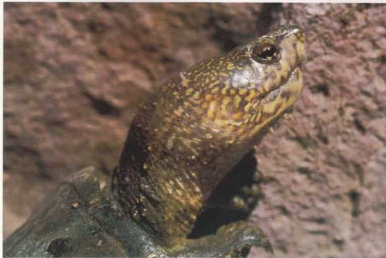
Figure 2. Head of live Kinosternon chimalhuaca , sp. nov., adult ♂ from a pond 50 m south of Río Purificación, 4.0 km west of Mexico Highway 200, Jalisco (CM 15235).