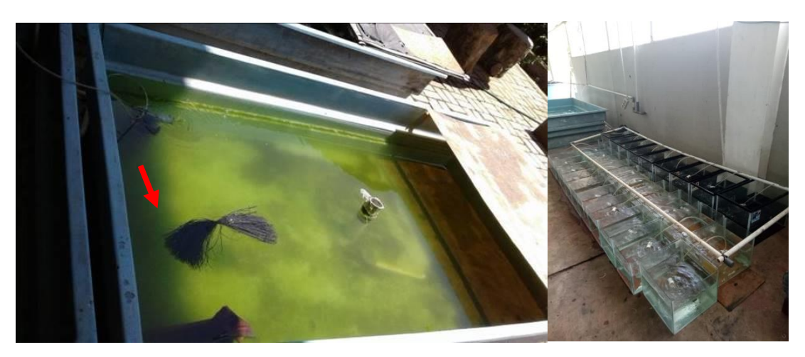
Figure 2. Rearing fiber tank with the substrate (arrow) and hatching aquarium.