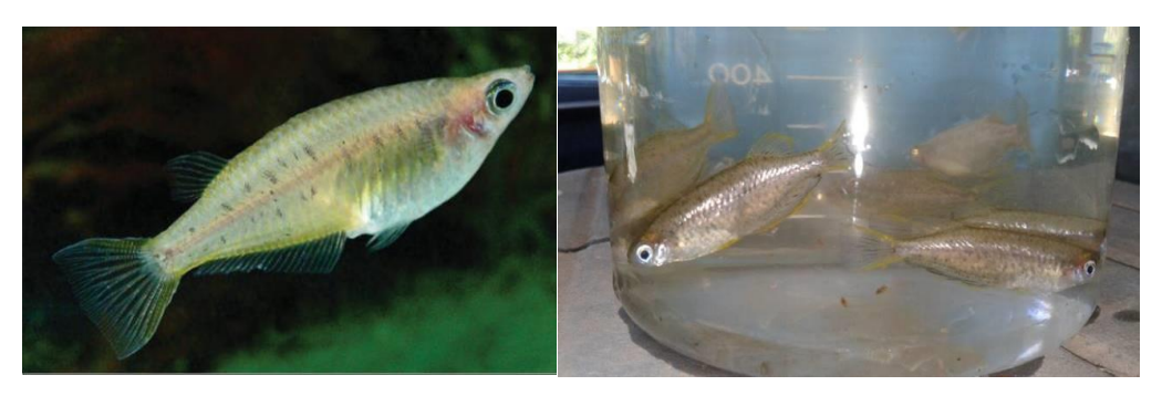
Figure 1. Oryzias marmoratus [17].

Ex-situ development is a technology that could be done to conserve certain species, especially endemic ones, from extinction. This effort is necessary to reduce exploitation activity. Ex-situ development of endemic fish has been successfully carried out by the Research Center for Limnology-LIPI and other institutions. Several types of fish that have been successfully developed such as Celebes Rainbow ( Marosatherina ladigesi ), endemic Rainbowfish of Papua ( Glossolepis incisus, Melanotaenia boesemani, Melanotaenia praecox ), Rasbora argyrotaenia, Tor douronensis, Melanotaenia parva, Amphiprion ocellaris, and others [18–23]. This research aims to evaluate the further development of O. marmoratus that have been adapted at controlled conditions or ex-situ habitat at the aquatic laboratory of Research Center for Limnology-LIPI. The component of evaluating such as the growth and reproduction viability of the adapted Marmorated medaka.