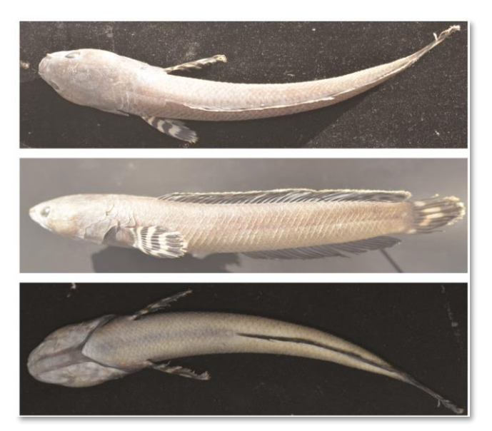
Fig. 2 Channa amari, ZSIFF7926, 111.5 mm SL; India: West Bengal, Alipurduar district, Bhalka forest, A. dorsal, B. lateral and C.ventral views of alcohol preserve specimen

Fig. 1 Channa amari ZSIFF7926, 111.5 mm SL; India: West Bengal, Alipurduar district, Bhalka forest, A. dorsal, B. lateral and C.ventral views of live specimen