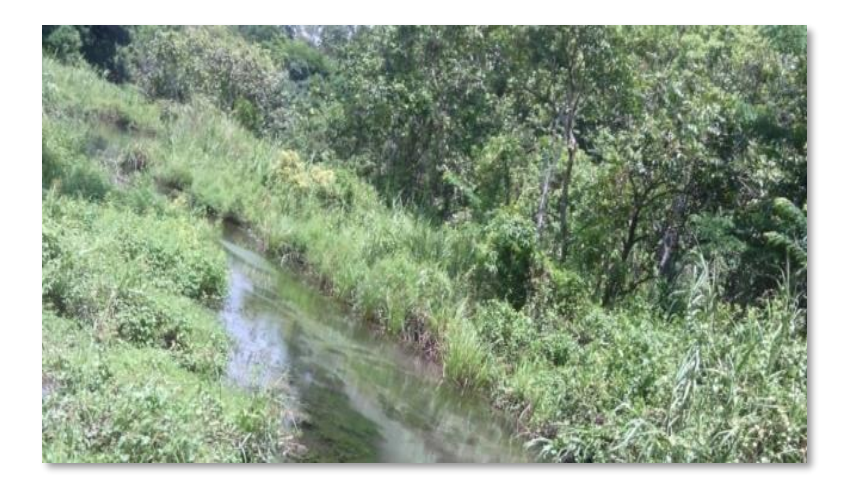
Fig. 4: Type locality of Channa amari, at Bhalka forest, Alipurduar district, West Bengal, India