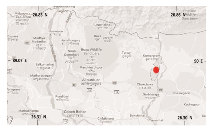
Fig. 3. Distribution of Channa amari (red circle) in the Bhalka forest, Alipurduar district, West Bengal, India

Fig. 2 Channa amari, ZSIFF7926, 111.5 mm SL; India: West Bengal, Alipurduar district, Bhalka forest, A. dorsal, B. lateral and C.ventral views of alcohol preserve specimen