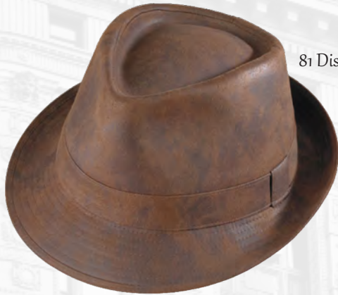
81 Distressed Brown

FAUX ULTRASUEDE LEATHER | FEDORA | LINED | SELF BAND WITH LOOP | SIZES: M-XL