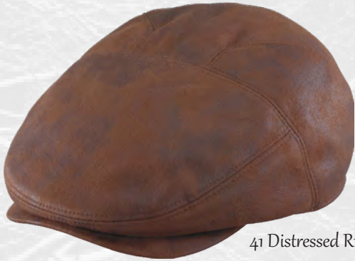
41 Distressed Rust

FAUX ULTRASUEDE LEATHER | DISTRESSED | IVY | SIZES: M-XL