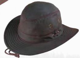
81 Dark Brown