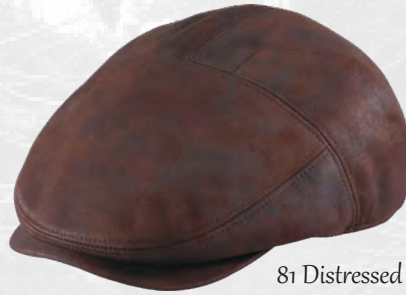
81 Distressed Brown