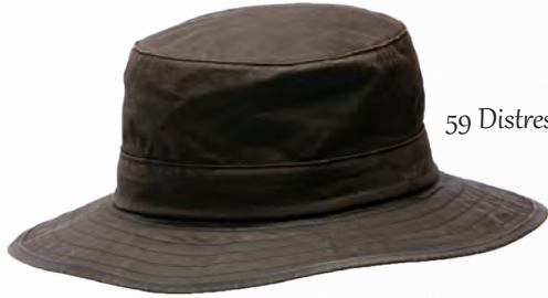
59 Distressed Gold

DISTRESSED COTTON | 2 3/4" BRIM | ADJUSTABLE BUNGEE | CHINCORD | BUCKET | SIZES: M-XL