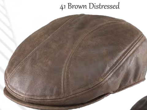
41 Brown Distressed

PREMIUM COWHIDE LEATHER | ELASTIC SWEATBAND | DRIVER CAP | SIZES: S/M & L/XL