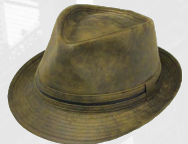
41 Distressed Rust