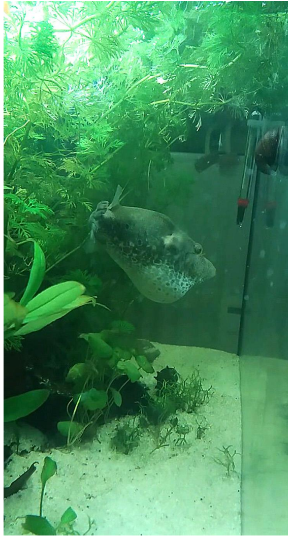
FIGURE 2. Aggressive behaviour: The egg-guarding female Pignose Puffer Pao suvattii swimming along the aquarium glass being inflated with water.

male's role in egg guarding and protection of the spawning pit. However, it is clearly recognisable that the behavioural patterns associated with the spawning event are not as coordinated as they would be under normal circumstances, e.g., shown by the dispersion of the eggs due to a continued and extensive cleaning of the spawning pit.