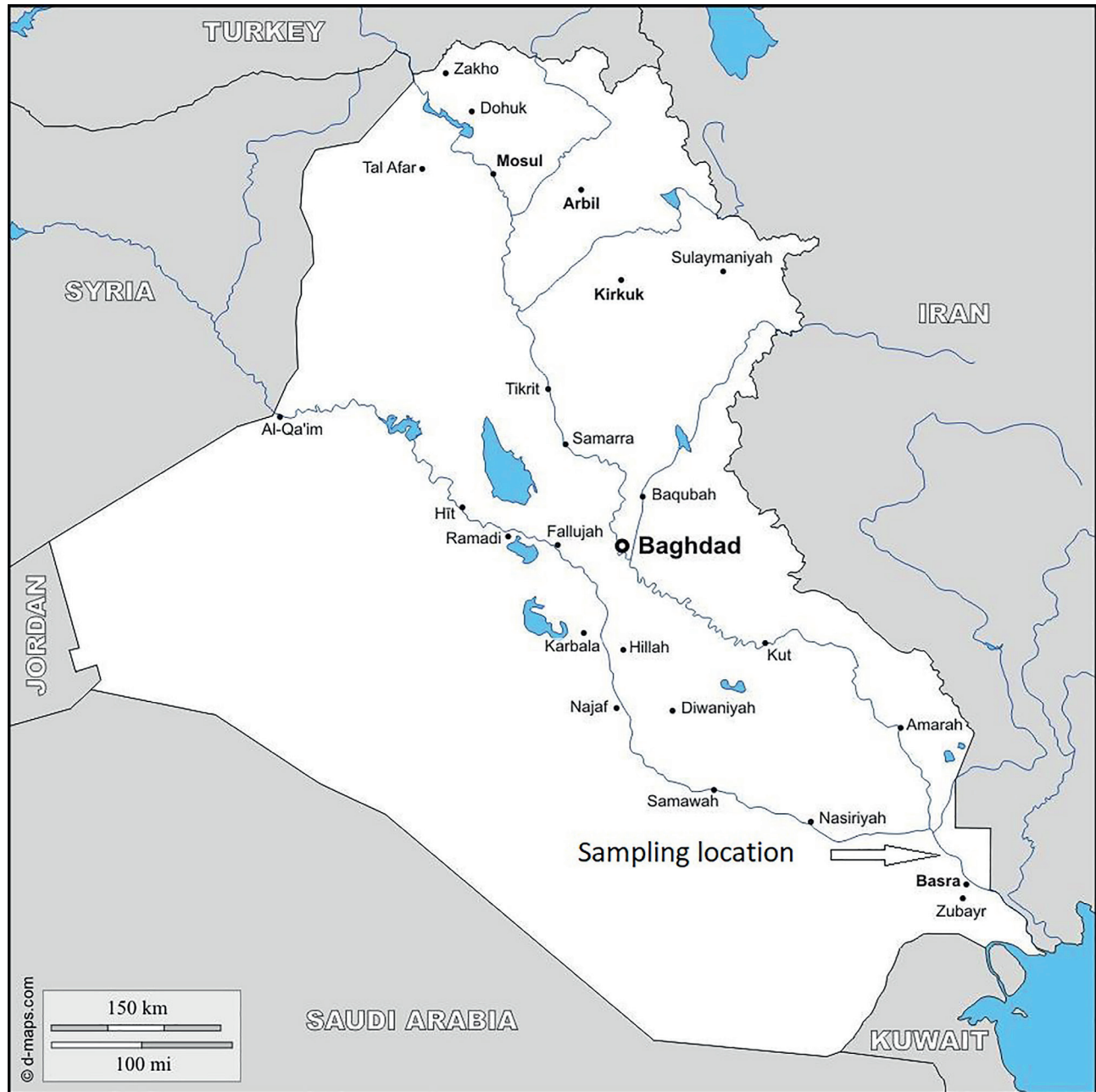
Fig. 1. Map showing the locality of collection (arrow) of Pterygoplichthys pardalis (Castelnaud, 1855) in the Shatt al-Arab River, Basrah, southern Iraq.

The present study reports on the presence of the Amazon sailfin catfish in the Shatt al-Arab River at Basrah, Iraq, where 175 individuals of P. pardalis were collected in 2017. This is the first record of this species from the freshwater system of Iraq in general and from the Shatt al-Arab River in particular.