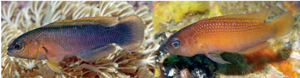
Plate 3.8. Two new Pseudochromis from Bali and Nusa Penida, 7 cm total length.