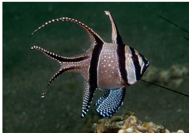
Plate 3.18. The introduced Banggai Cardinalfish ( Pterapogon kauderni ), 8 cm TL, Secret Bay, Bali.