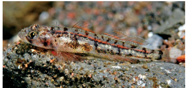
Plate 3.14. Grallenia baliensis , 2.5 cm total length.