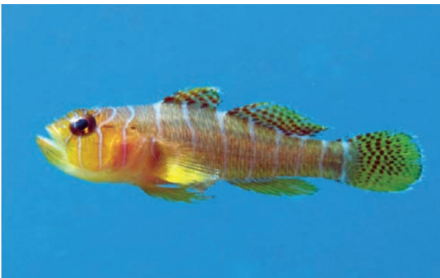
Plate 3.13. Priolepis sp., 2.5 cm total length.