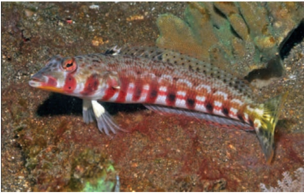
Plate 3.6. Parapercis bimacula , 11 cm total length.