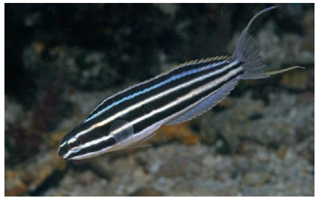
Plate 3.12. Meiacanthus cyanopterus , 6 cm total length.