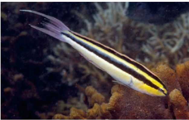
Plate 3.11. Meiacanthus abruptus , 7 cm total length.