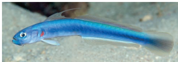
Plate 3.16. Ptereleotris rubristigma , 10 cm total length.