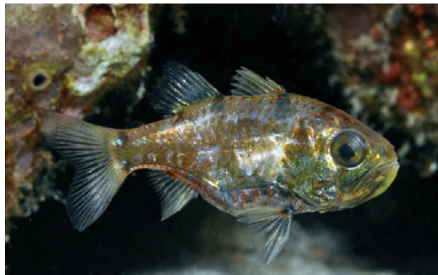
Plate 3.9. Siphamia sp., 3.5 cm total length.