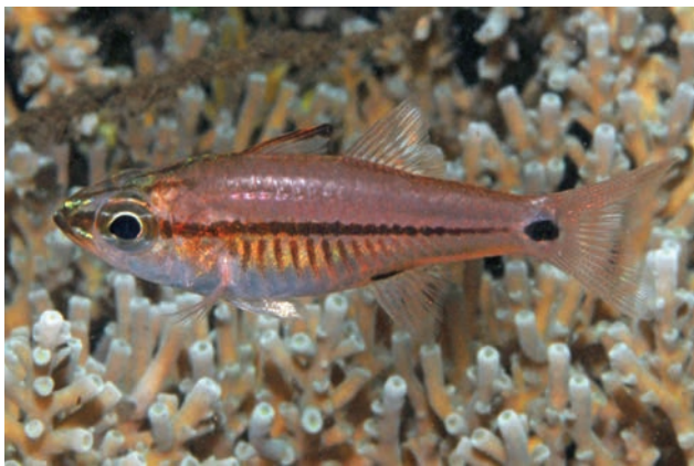
Plate 3.2. Apogon lineomaculus , 6 cm total length. Known only from Bali and Komodo.