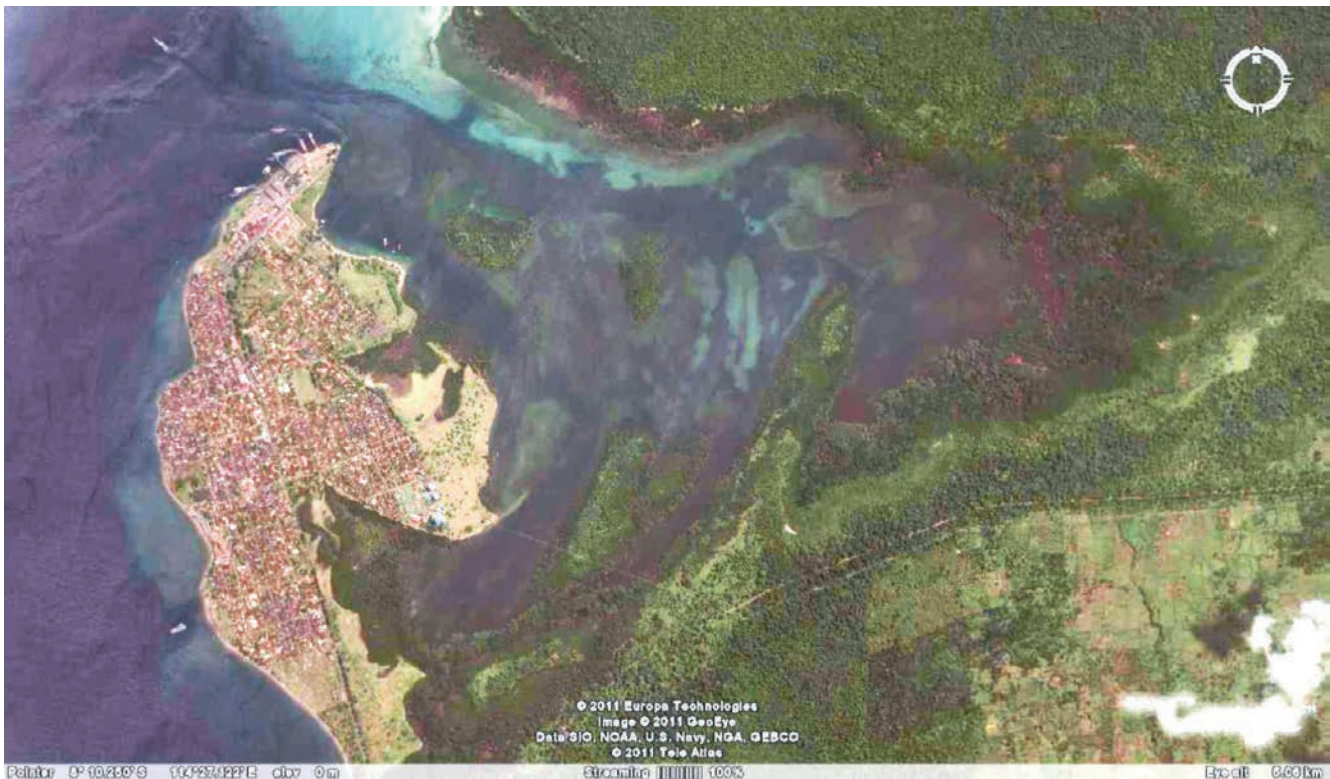
Figure 3.1. Satellite image of Secret Bay at Gilimanuk.

of Nusa Penida. These cases involved crosses between the butterflyfishes Chaetodon guttatissimus and C. punctofasciatus and the angelfishes Centropyge eibli and C. vroliki (Plate 3.4). Although no hybrids were detected between the closely related Chaetodon lunulatus and C. trifasciatus , several mixed pairs between these species were seen during both the 2008 and 2011 surveys.