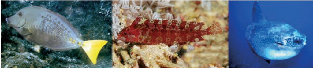
Plate 3.5. Examples of Bali species associated with areas of cool upwelling: from left to right – Prionurus chrysurus , Springeratus xanthosoma , and Mola mola .