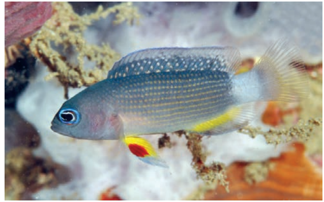
Plate 3.7. Manonichthys sp., 3.5 cm total length.