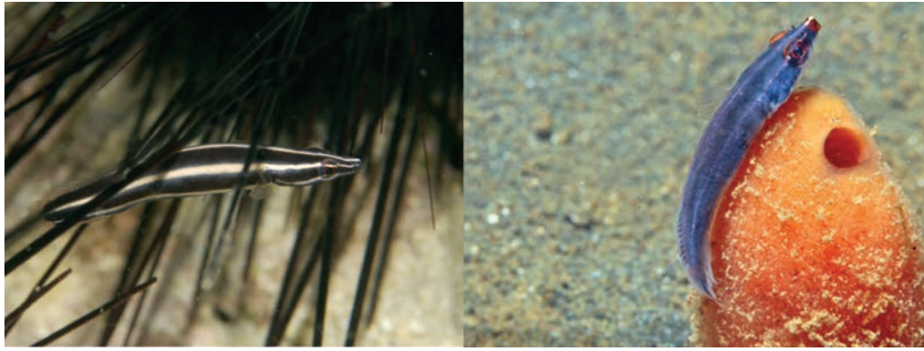
Plate 3.15. Lepadichthys sp., 3 cm total length.