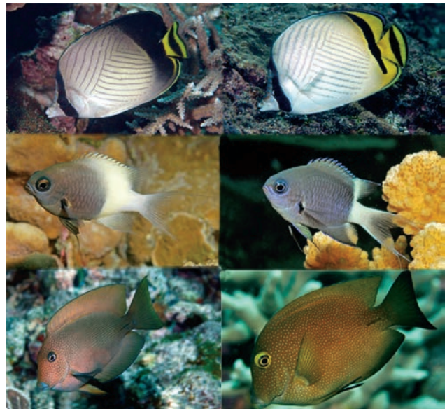
Plate 3.3. Examples of geminate species pairs (Indian Ocean species on left and Pacific species on right): upper— Chaetodon decussatus and C. vagabundus ; middle— Chromis dimidiata and C. margaritifer ; lower— Ctenochaetus cyanocheilus and C. truncatus .