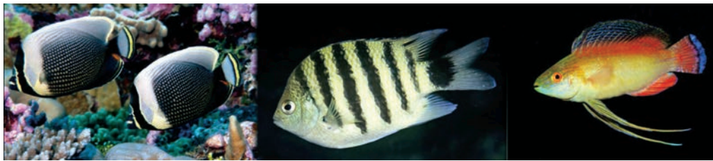
Plate 3.17. New distributional records included (from left to right): Chaetodon reticulatus , Abudefduf lorentzi , and Cirrhilabrus pylei .