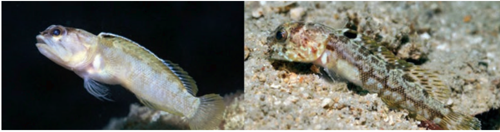
Plate 3.10. Two new jawfishes (Opistognathidae) from Bali (left to right): Opistognathus species 1, 4 cm total length, Opistognathus species 2, 3.5 cm total length.