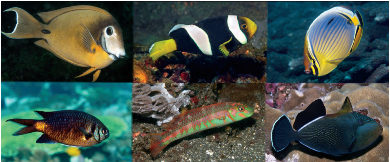
Plate 3.1. Example of Indian Ocean species at Bali (from left to right starting on top): Acanthurus tristis , Amphiprion sebae , Chaetodon trifasciatus , Chromis opercularis , Leptojulis chrysotaenia , and Melichthys indicus .