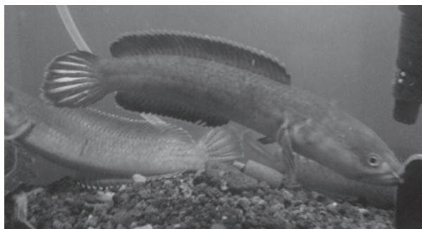
Fig. 2. Live Stock of Channa gachua captured from Brantas river basin, East Java.

The Fifty four (54) specimens of Channa gachua had a total length between 8 and 28 cm . Six (6) of them were labeled and fixed in 96% ethanol (Hasan et al. , 2019a) and deposited at the Hydrobiology Laboratory, Universitas Brawijaya, Malang, Indonesia (LH.0001) (Fig. 2). The remaining forty eight (48) were kept as livestock at the Fish Reproduction Laboratory, Brawijaya University, Malang Indonesia (Fig. 3).