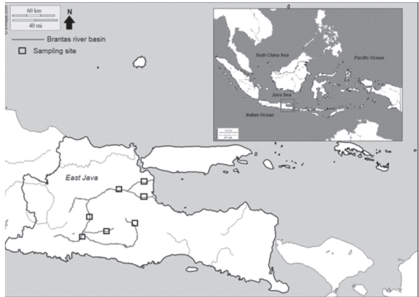
Fig. 1. Sampling site and map of Brantas river basin.