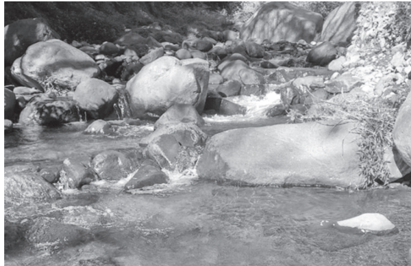
Fig. 4. Upstream of Brantas river basin, one of the ideal habitats for Channa gachua .

the Java, which was a further distance main rivers such as Bengawan Solo river basin (other river basin in East Java), Serayu river basin (Central Java) and Citarum river basin (West Java). For a native fish, distribution records are important contributions for understanding species diversity and biogeography (Iqbal et al. , 2017; Hasan et al. , 2019b; Valen et al. , 2020).