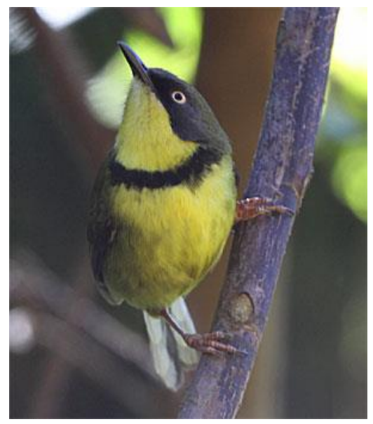
Bar-throated Apalis (Yellow-throated)

Birdwatching started in the early morning around the lodge (accompanied by Ronald's Great Dane/Lab mix Patch). We could have spent the whole day following the nice paths winding up and down the plateau, but we had some important species to go for in several other sites. We dropped off wife and kids at "Maggie's stable" for a nice mountain ride while Ben and I went in search of some Zomba specials. We did quite well, I think, in just a few hours we had nice views of several sought after species like Orange Ground-Thrush, Cholo Alethe, Bar-throated Apalis