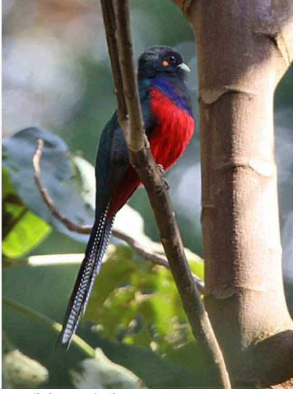
Bar-tailed Trogon in Chowo Forest

Scrub Hare, Tanganyikan Mountain Squirrel, Side-striped Jackal, Crawshay's Zebra, Common Warthog, Bushbuck, Eland, Grey Duiker, Red Duiker, Southern Reedbuck and Roan Antelope.