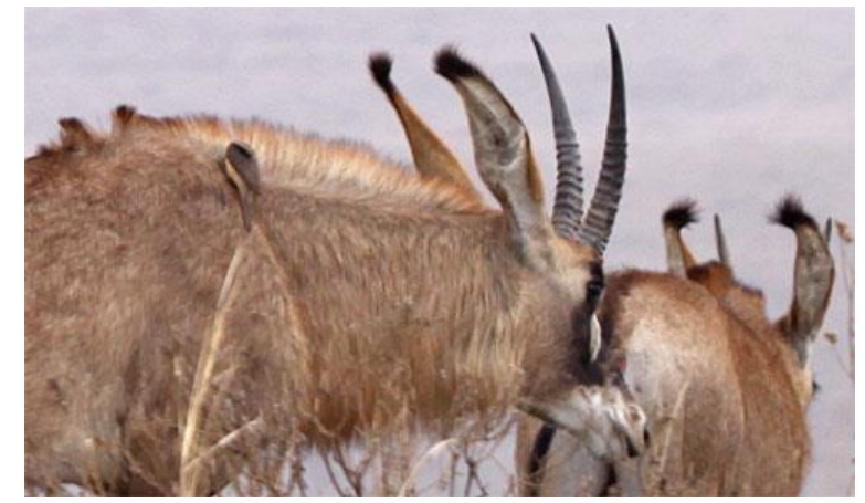
Roan Antelopes and Yellow-billed Oxpecker

The following days we had very nice meals prepared by Dominique and very nice game and bird