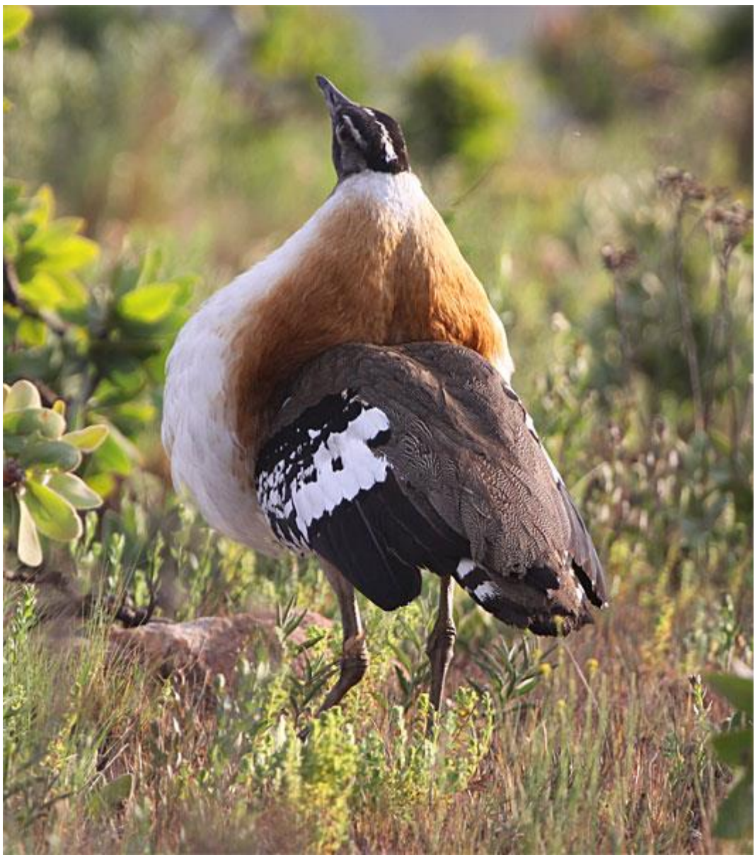
Stanley Bustard (Denham's) in Nyika National Park