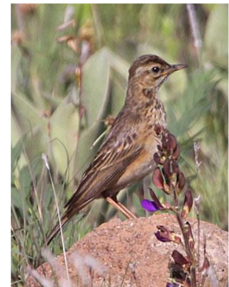
Dark (although young) African Pipit in Nyika

One of Nyika's most famous birding localities is Chowo Forest (in Zambia). We visited twice. Another almost as good forest is Zovo-Chipolo which we visited once. We also drove "Chelinda Valley circular route" and birded around the Chelinda dams.