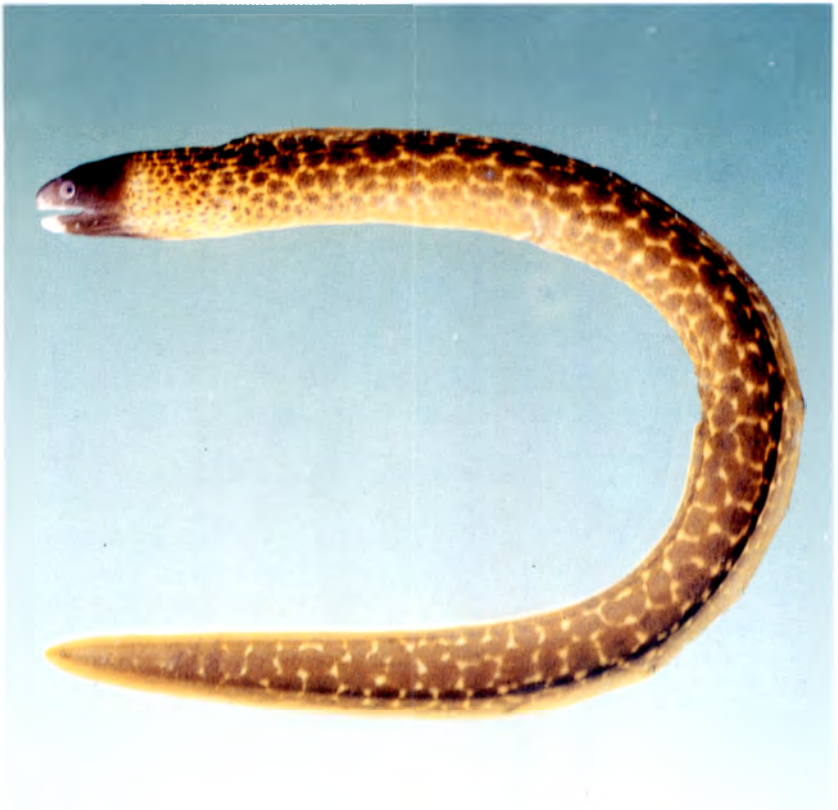
Figure 1. Holotype of Siderea flavocula , BPBM 36155, 407 mm TL.

teeth plus two longer depressible inner teeth anteriorly, larger specimens with single row of 7 teeth only. Vomerine teeth 14-18, small and rounded, irregularly biserial anteriorly, the last 3 uniserial, the row beginning below level of eye and extending posteriorly beyond jaw teeth. Lower jaw with 3-4 stout inner teeth anteriorly flanked by an outer row of 6-9 close-set short teeth, continuing as row of 7-11 sharp triangular teeth.