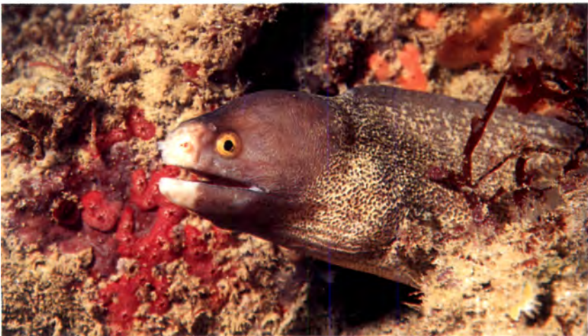
Figure 3. Underwater photograph of large (estimated 550 mm TL) individual of Sideria flavocula .