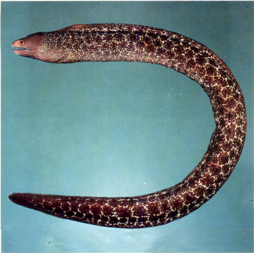
Figure 2. Paratype of Sideria flavocula , BPBM 36382, 150 mm TL.